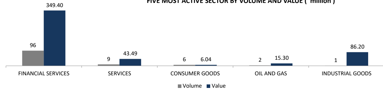
FIVE MOST ACTIVE SECTOR BY VOLUME AND VALUE ('million')