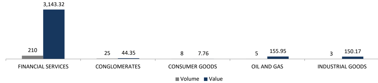
FIVE MOST ACTIVE SECTOR BY VOLUME AND VALUE ('million')